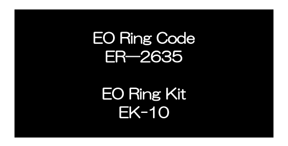
EO Ring Code